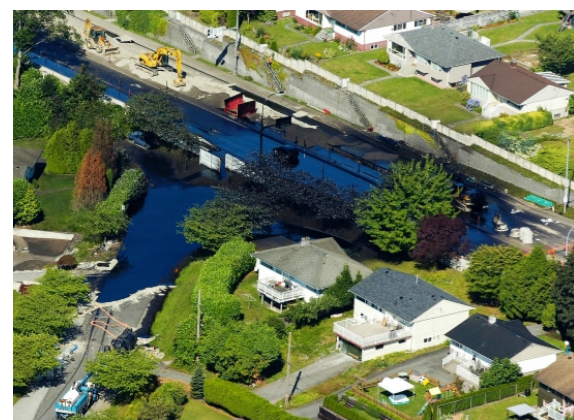
The 2007 Kinder Morgan oil spill in Burnaby