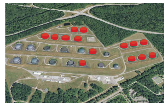
Proposed Burnaby Mountain Oil Tank Farm expansion