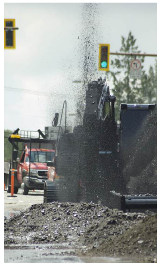
The 2007 Kinder Morgan oil spill in Burnaby